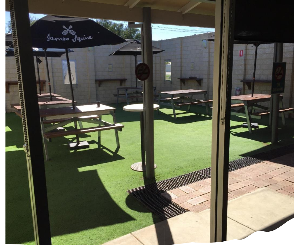
Jurien Bay Hotel