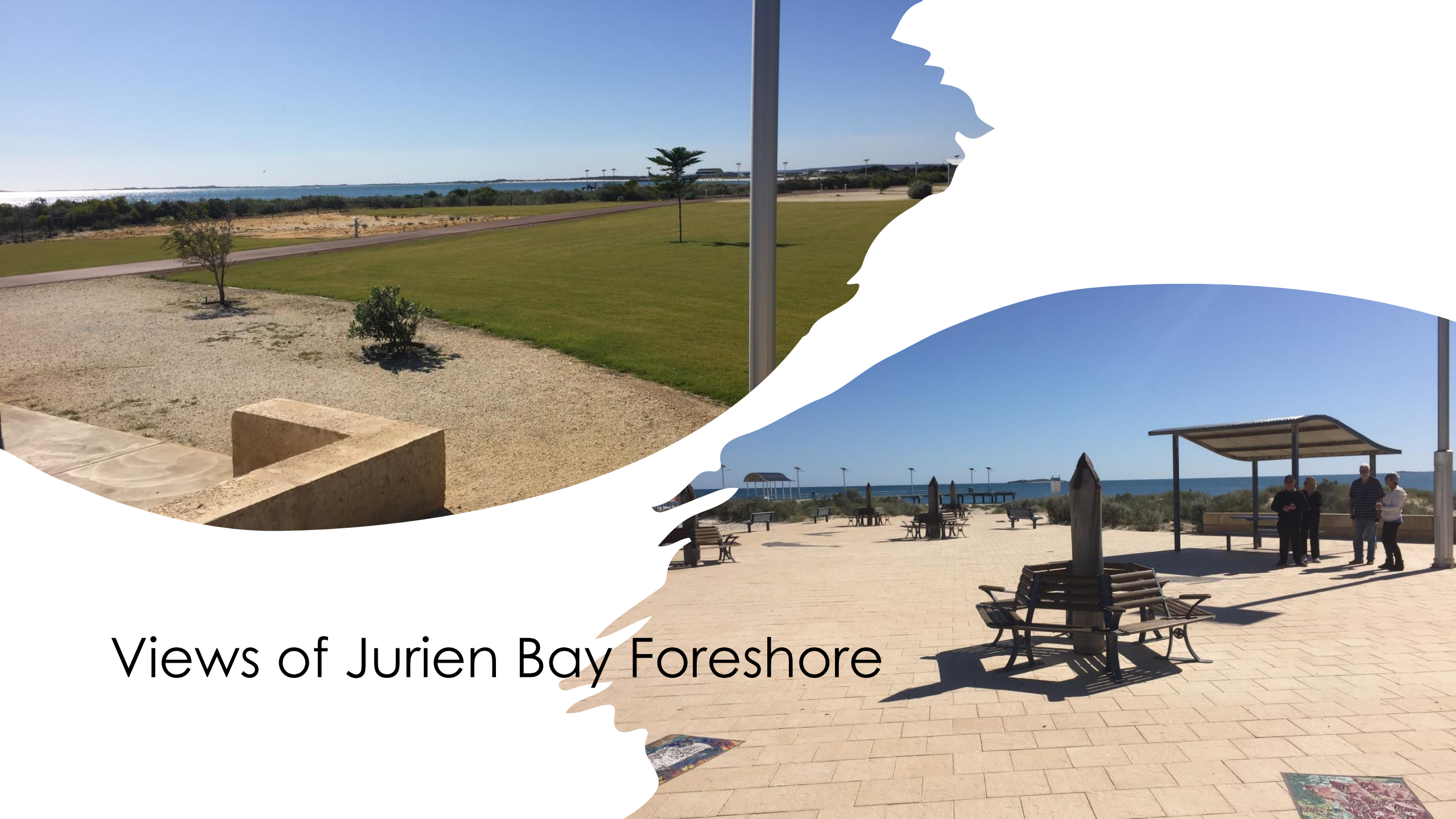
Views of Jurien Bay Foreshore