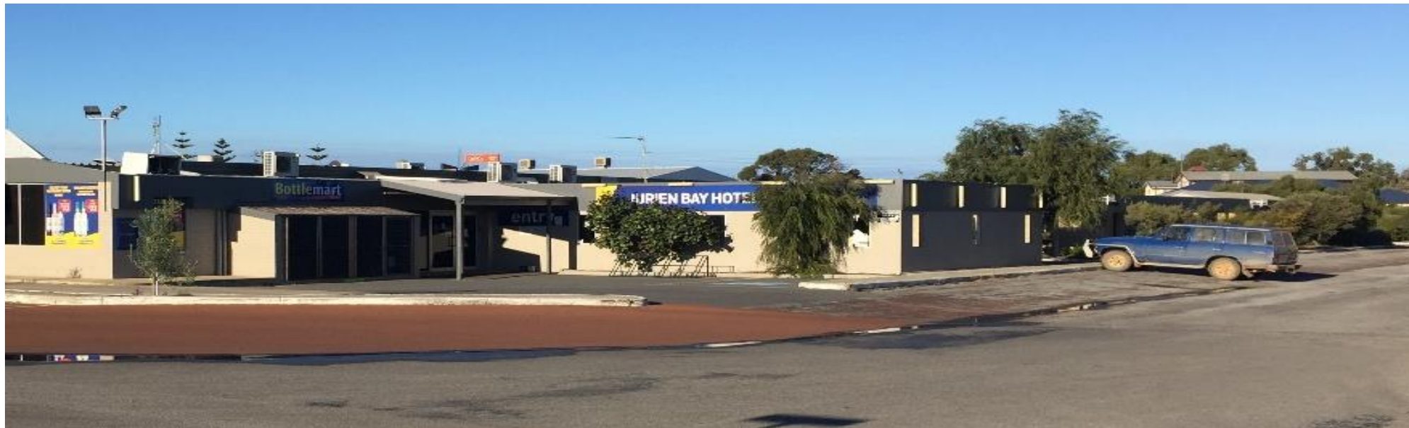
Jurien Bay Hotel Motel